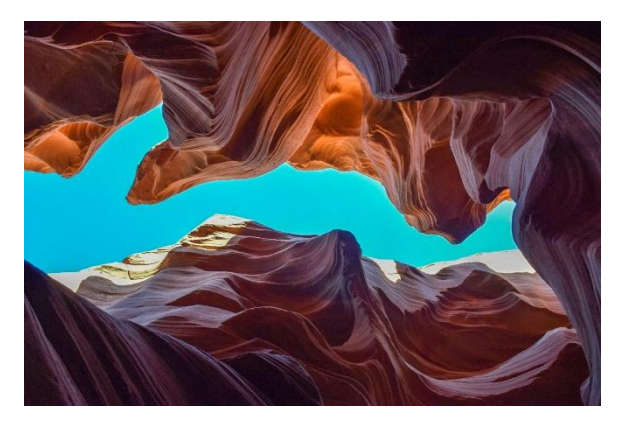
Lower Antelope Canyon

In the afternoon you will be escorted around Bryce Canyon National park.