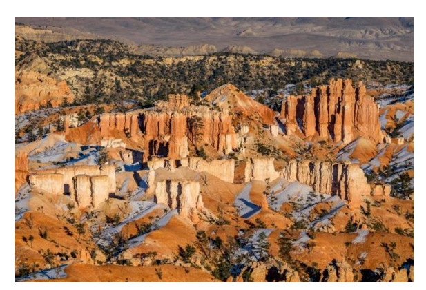
Bryce Canyon National Park

Hotel breakfast, embark on your tour to Bryce Canyon National Park , a fantasyland of hoodoos, bizarre rock formations and sandstone pillars. The unique landscape sets it apart from other national parks, we recommend a hike through a garden of hoodoos, take in the view from multiple vantage points and thoroughly explore the park.