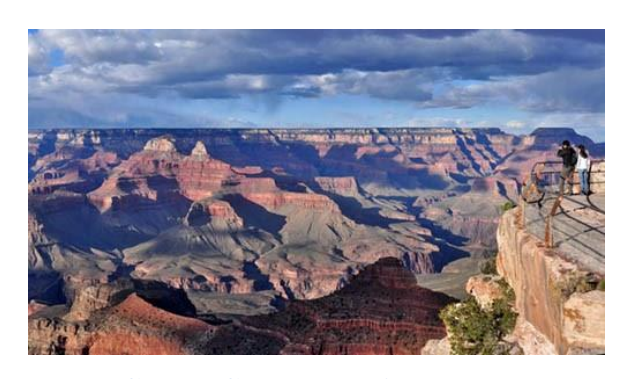
Grand Canyon National Park

Experience an amazing helicopter ride to take in the massive structure (optional). Overnight Grand Canyon.